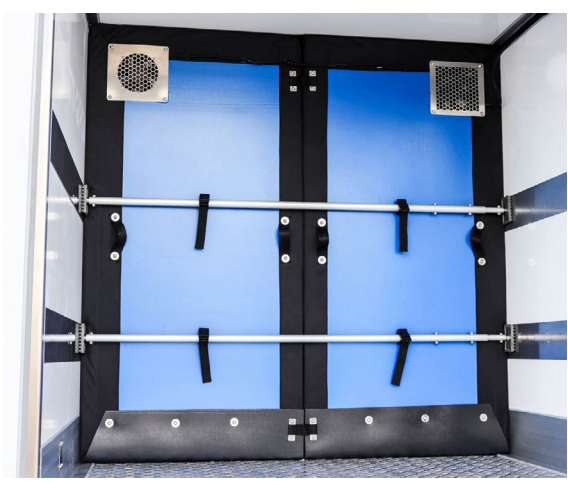
Multi-Zone Adjustable Panel