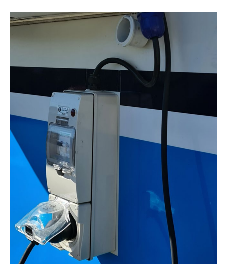
Standby 240V Refrigeration